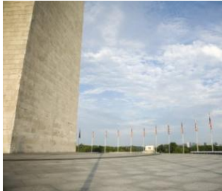
Operation Bootstrap Report